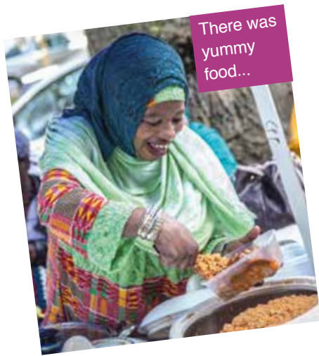
There was yummy food...