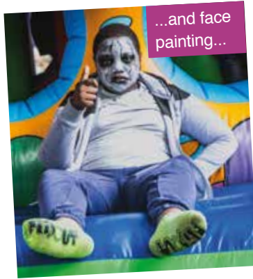
...and face painting...