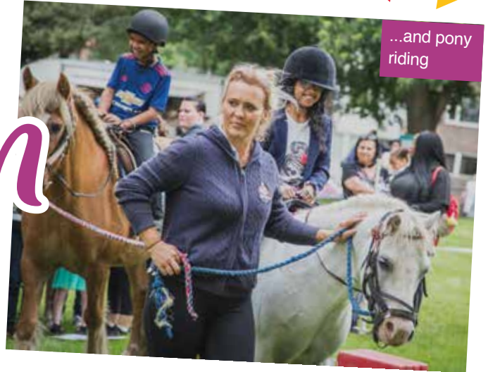
...and pony riding