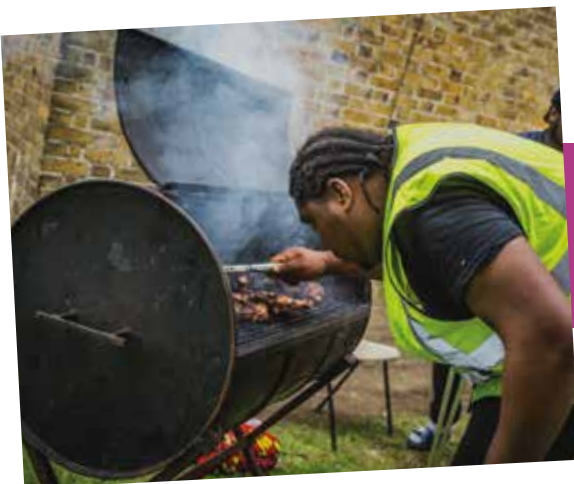
Somehow the chicken got lost...but was quickly found again!